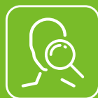
Touchless for Better Hygiene