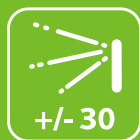
Wide Pose Angle Acceptance