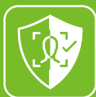
New Height of Anti-Spoofing