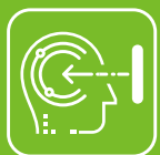
Proactive Facial Recognition