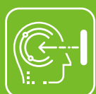
Proactive Facial Recognition