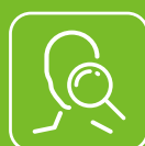
Touchless for Better Hygiene