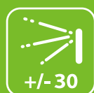
Wide Pose Angle Acceptance