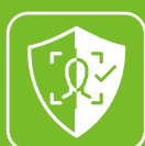
New Height of Anti-Spoofing